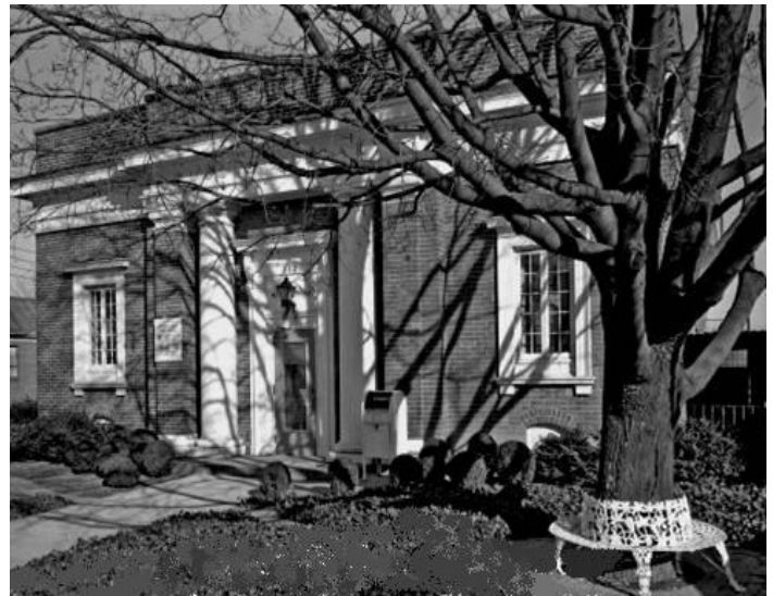
The first Henderson County Public Library was donated by Andrew Carnegie and the property by Capt. Marion Columbus Toms. The building stands on the corner of Fourth Avenue and King Street and served as the county library until July 1970.

The new facility was designed to accommodate a growth span of twenty years, but due to the rapid growth and expansion of the county population the library had once again outgrown the facility by the mid-1980s. On July 25, 1990, groundbreaking for a two-story main library addition took place, and in 1992 the main library opened its newly expanded 42,500-square-foot facility containing 140,000 volumes.