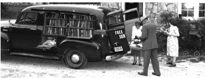
The free service library bookmobile in 1943.

During these two decades the library went through a period of considerable transformation as paper card catalogs were replaced with computerized catalogs, obsolete collections were removed, new audiovisual collections were begun, and annual circulation reached 500,000. The library used updated community information and analysis to aid in planning and executing this transformation, and to ensure that the needs of the community were being met throughout the process.